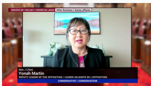
3RD READING SPEECH ON BILL S-223: AN ACT RESPECTING KINDNESS WEEK