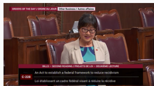
2ND READING SPEECH ON BILL C-228, AN ACT TO ESTABLISH A FEDERAL FRAMEWORK TO REDUCE RECIDIVISM